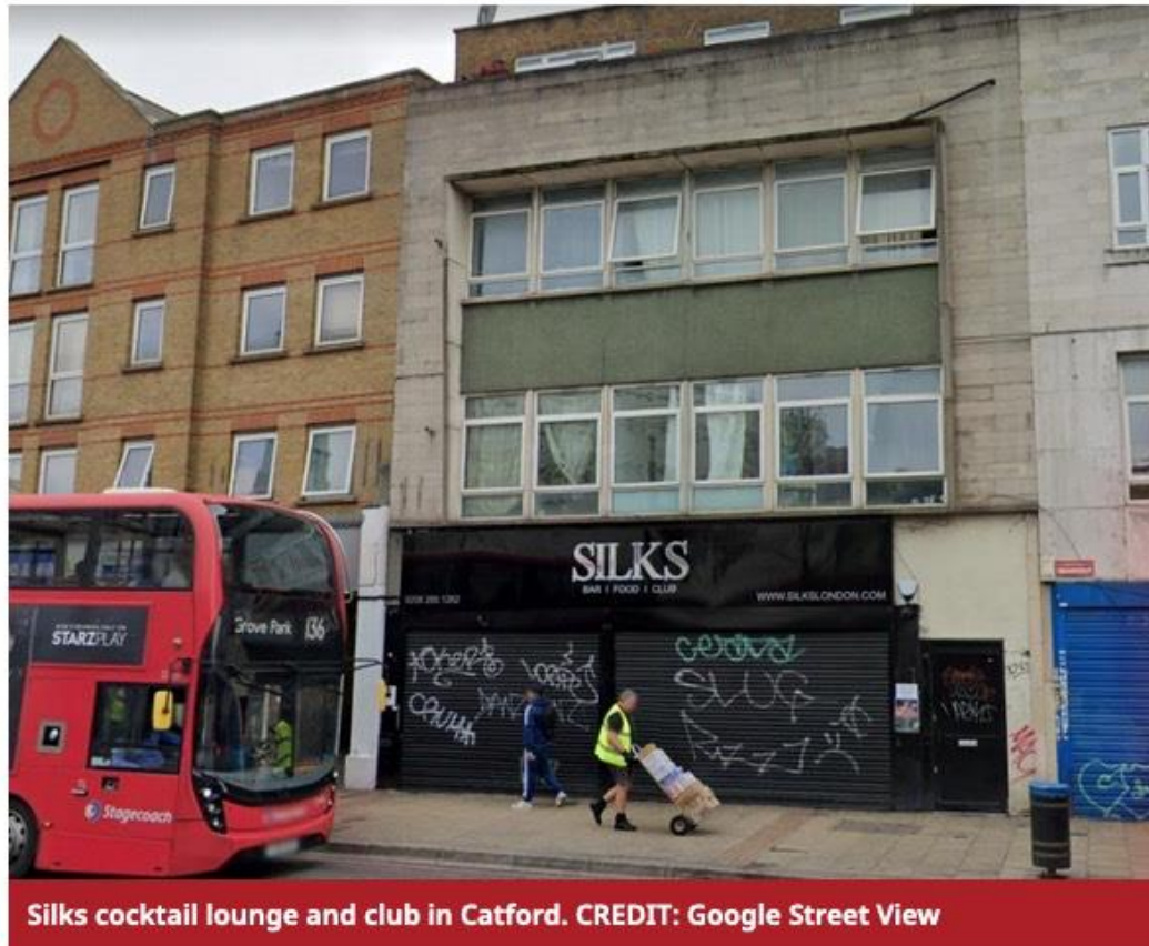
Silks cocktail lounge and club in Catford.