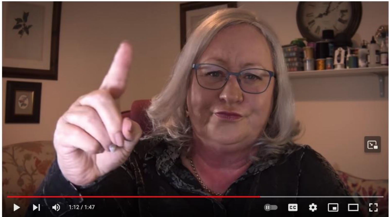
Jack Whitehall opens the show with Jackie Weaver and the Line of Duty cast | The BRIT Awards 2021